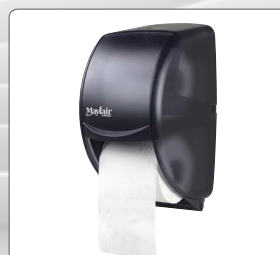
Standard Bath Tissue Dispenser