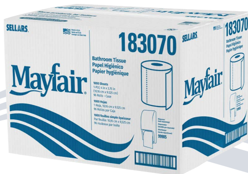
1-Ply Bath Tissue (1,000ct) Outer Case